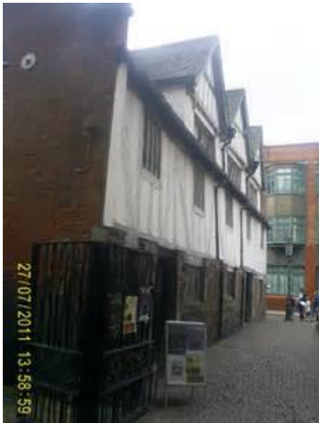
Cobbled path leading to Leicester Guildhall entrance