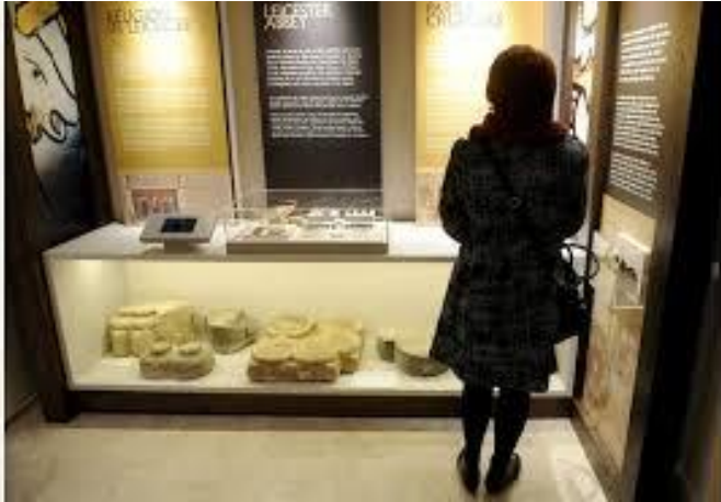
Image of the Medieval Galleries