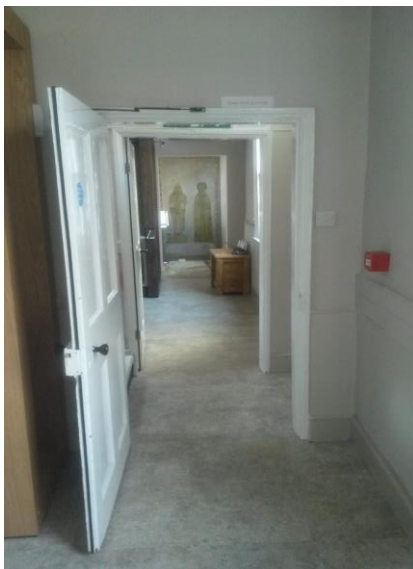
Corridor to the Medieval Galleries.