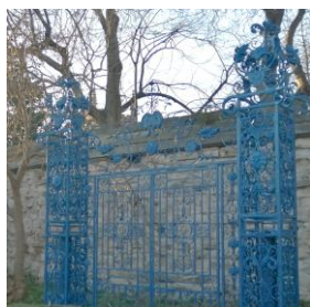
Quenby Hall Gates