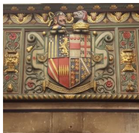
Ragdale Hall Fireplace