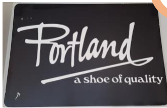
The Portland Shoe Company