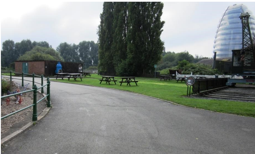
Abbey Pumping Station Grounds