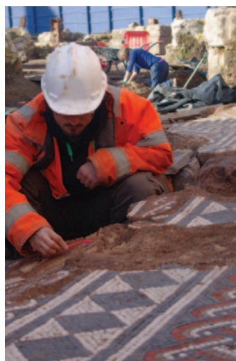
Excavations at the Stibbe Site.