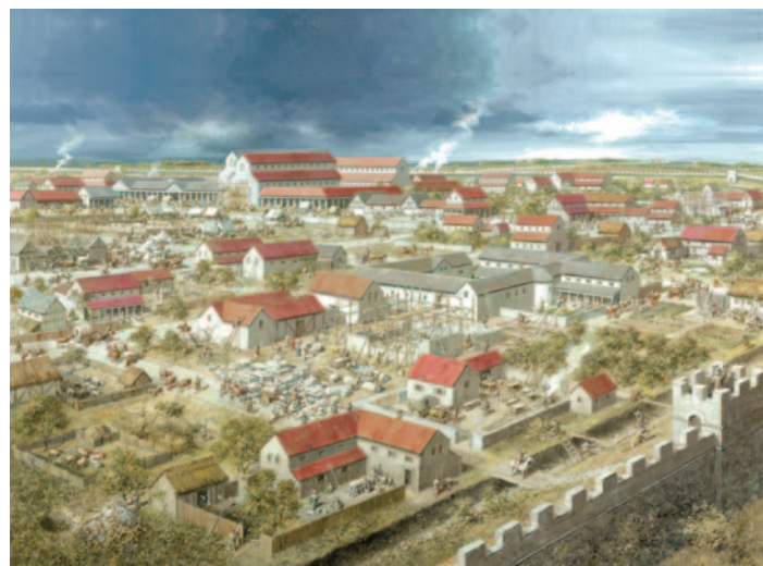
Artist's impression of Roman Leicester in the late 3rd century AD looking south-west.