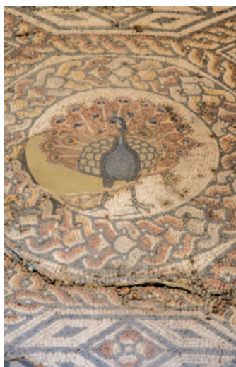
Peacock mosaic, discovered in St. Nicholas Street, 1898.

The main part of the walking trail should take between an hour and 90 minutes to complete, at a moderate pace (stops I-8). It has as an extension of three additional sites (stops 9-11) and a another three a little further afield (stops A-C). We hope that exploring Leicester's busy, multi-cultural streets gives you a flavour of the bustling, diverse Roman city that once thrived here.